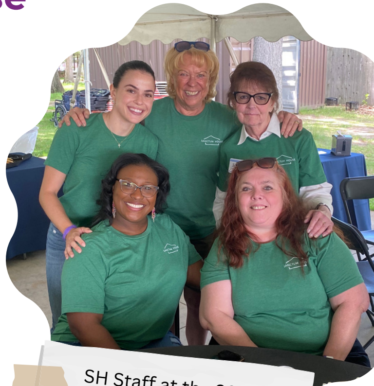
SH Staff at the 2022 Volunteer Luncheon

Volunteering at Sanctum House blossomed in 2022. Our community reliably supports Residents with a variety of needs, including errands, mentorship, cooking classes, and more.